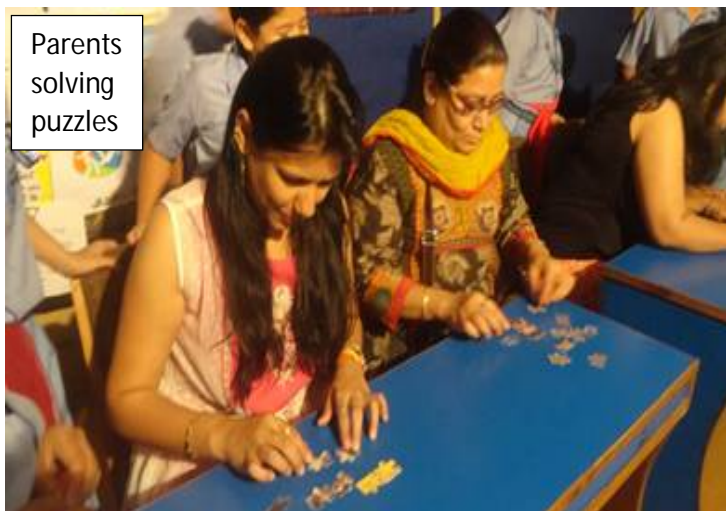
Parents solving puzzles