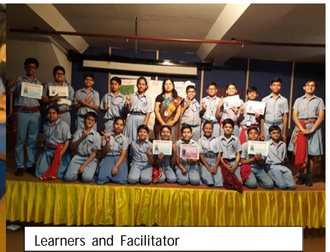
Learners and Facilitator