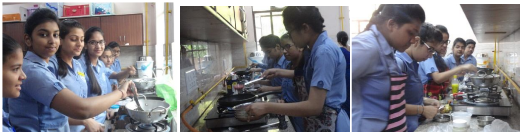
MODE ET STYLE-Class XI