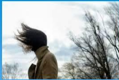
Properties of Air